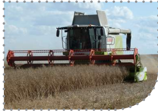
Pod shatter resistance can help reduce harvest losses.