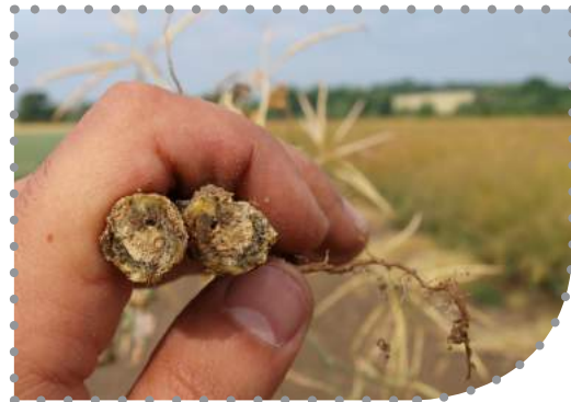
Arrow has the best combination of resistance to Light Leaf Spot and Stem Canker out of all varieties on the AHDB Recommended and Candidate Lists 2017/18.

Jan 2017. Data from the AHDB Recommended List 2017/18. On the 1-9 scales, high figures indicate that a variety shows the character to a high degree.