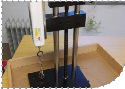
Arrow has been tested for pod shatter resistance, meaning potential seed losses can be dramatically reduced.

Arrow possesses the valuable genetic trait of pod shatter resistance, providing growers with the ability to dramatically cut seed losses both before and during harvest. This can result in higher and more stable yields, as well as reducing volunteer pressure. Pod shatter resistance is especially valued in our unpredictable climate, when thunderstorms and delayed harvests are increasingly common. It is also important at harvest when the passage of the combine through the standing crop can cause significant losses.